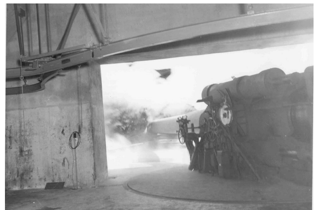
Battery Kingman - 2x12-inch Long Range Guns in casemate firing 1943