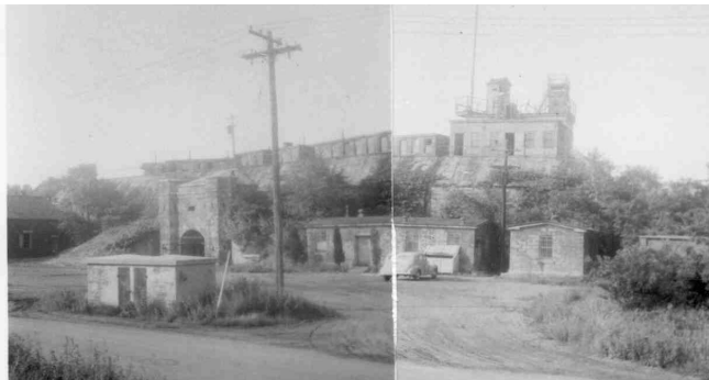
HECP #1 (Btry Potter), Ft. Hancock