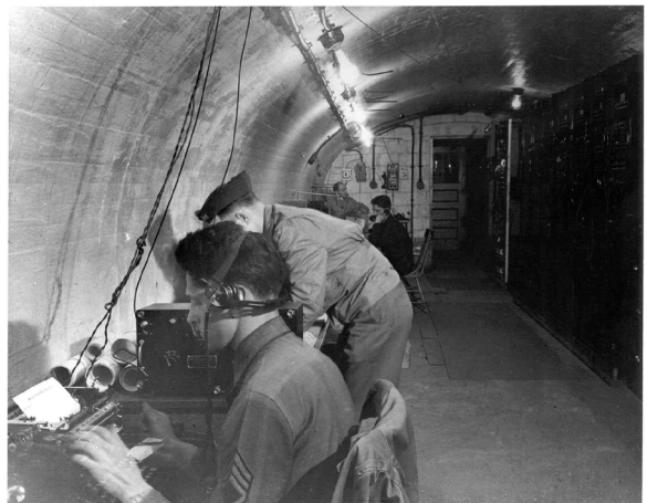
Switchboard Room, HDCEP, Ft. Hancock