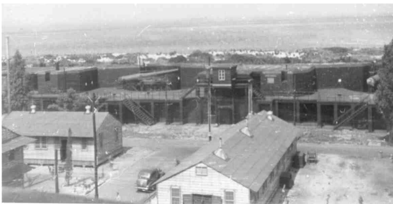
Battery Bloomfield - 2x12-inch DC guns 1941

Status: Class "A" - ready to fire in 15 min; Class "C" - ready in two weeks