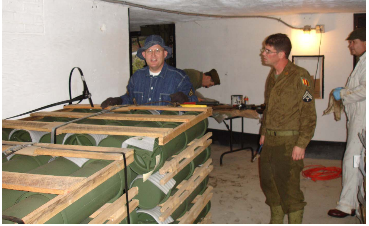
The photo below shows the team stacking the cans on their ends once the main wall was cleared.

The next step in storing the powder cans was to disassemble them from their shipping pallets and then restacking them inside the powder magazine. The photo below shows the team un-banding and moving the cans away from the magazine wall.