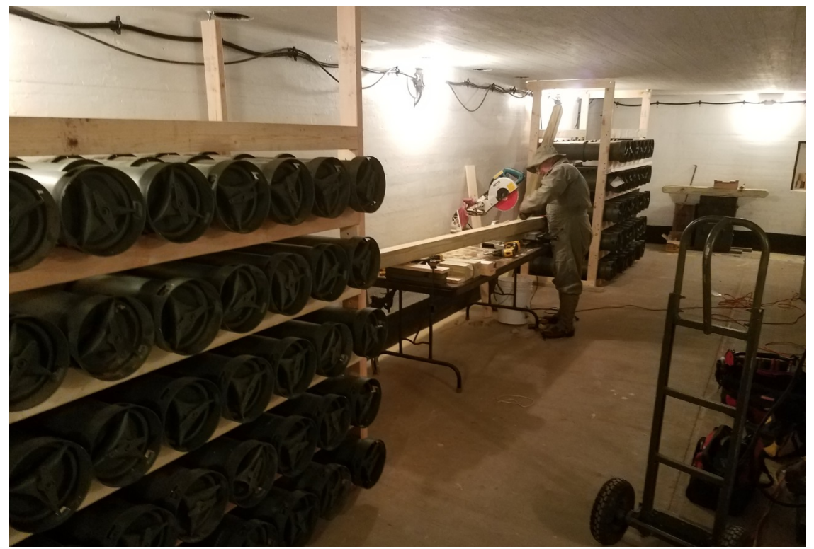
The photo below shows another view of the two racks from the northern end of the gun battery looking south (towards gun #1).

On 13 February 2020 the second rack is well underway. The space between the two racks where the saw table is located is the future home of the storage boxes. This is looking north towards Gun #2.