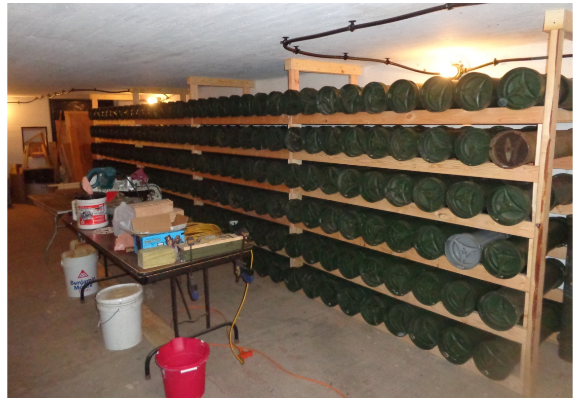
Photo below shows the two end stack with storage boxes in the center. This photo was also taken 7 March 2020 before the area was cleaned and the area policed.

A view from the opposite side of the previous photo looking towards Gun #2 just after the can have been stacked on 7 March 2020.