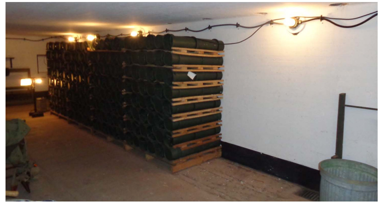
Below is the initial stack of cans into the Gun #2 powder passage.

The photo below shows the long "stack" along the shell room wall being reduced and the cans moved to the Gun #2 powder passage.