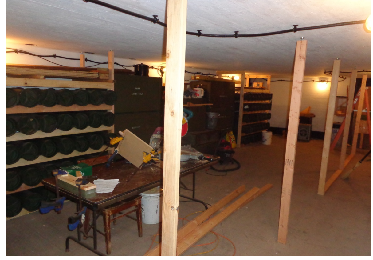
Below is the same view looking towards Gun #1 (looking south).

The photo below (looking north towards Gun #2) shows the storage boxes moved in between the two powder racks. The frame for the long wall rack is going into place.