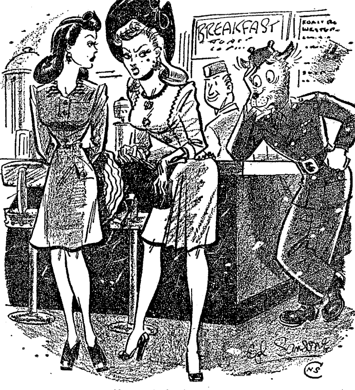
'Can my slip be showing?'