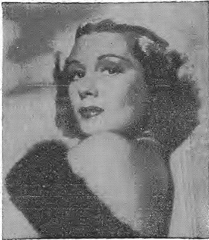
Gladys Swarthout, top name singing star, who is slated to appear here as one of many famous artists scheduled on Fort Hancock's summer payroll.