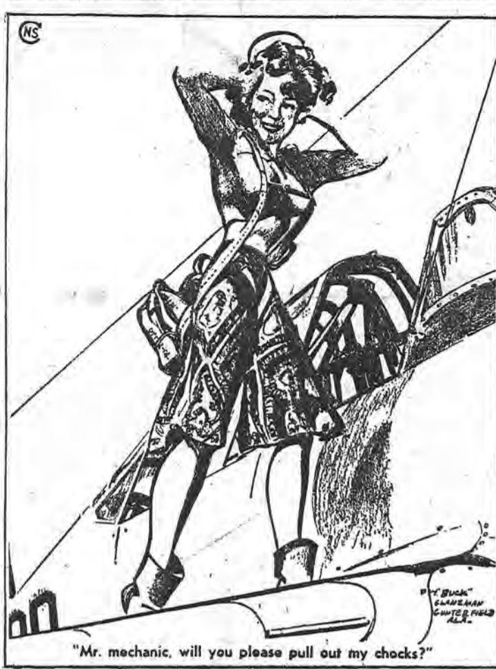
"Mr. mechanic, will you please pull out my chocks?"