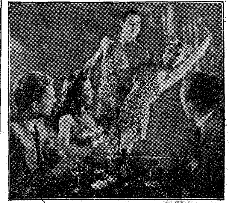
Joseph Cotten, an American citizen in Turkey, watches the exotic dance of Dolores Del Rio, the Leopard Woman, in this scene from Orson Welles' latest film production, "Journey Into Fear" at Post Theatres tonight.