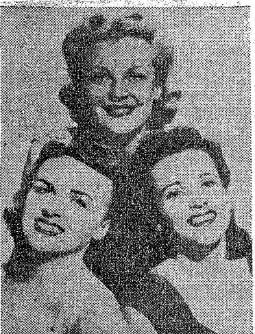
The Three Debs who will be aboard the Camel Caravan which halts at Theatre No. 2 at 8 p. m. Tuesday.